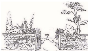
The Quiet Garden Movement

The garden offers a peaceful retreat in nature, featuring separate areas for quiet, solitude, and prayer, perfect for personal reflection and renewal. Whether you're seeking time alone or want to join with others for a reflective quiet day reach out to Sanctuary.